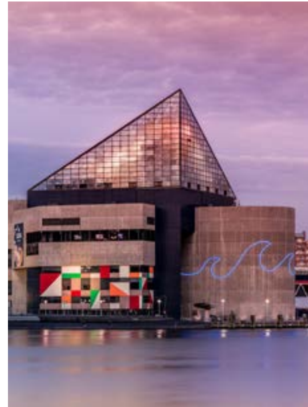
In its first year alone, the Aquarium attracted 1.4 million visitors, hosted 100,000 students on field trips and was supported by 27,000 members—a solid foundation that the institution has built upon in the 35 years since.

In 2016, the National Aquarium announced three priority projects that will elevate our leadership role nationally and build capacity for sustainable growth. When it opens in 2018, the Animal Care and Rescue Center will provide a permanent and modernized headquarters for our animal care facilities and rescue operations, with more opportunities for guests to experience this behind-the-scenes work. Soon after, a revitalized waterfront campus will introduce a new model for urban conservation as we transform our corner of the Inner Harbor into a living laboratory with floating wetlands and other publicly accessible exhibits that celebrate and interpret our Chesapeake Bay watershed. And by creating North America's first dolphin sanctuary, the National Aquarium will set a new standard for cetacean care. The sanctuary was announced in June 2016, with the plan to move the dolphins to the sanctuary in 2020.