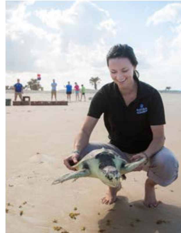
In 2016, the National Aquarium released 16 rescued animals to their ocean home and began work on the Animal Care and Rescue Center, which is set to open in 2018.

In 2016, National Aquarium Animal Rescue celebrated its 25th anniversary and the 173 animals released during that time. In 2016 alone, the team rehabilitated 16 injured animals and returned them to their ocean home. The Animal Rescue team traveled to California in April to help respond to a mass stranding of emaciated sea lion pups along the West Coast, a result of diminished availability of sea lion food sources, including Pacific sardines, northern anchovies, rockfish and squid. Work also began on the Aquarium's new Animal Care and Rescue Center, which is slated to open in 2018, providing a modernized and permanent home for our animal care and rescue operations, and unique opportunities for guests to peek behind the scenes. None of this would be possible without you!