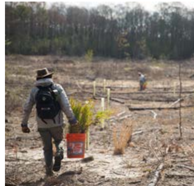
Since 2009, the National Aquarium has worked with our partners at The Nature Conservancy to plant more than 25,000 Atlantic white cedar saplings throughout the Nassawango Creek Preserve.