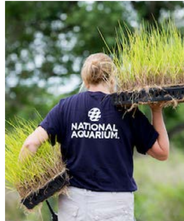
National Aquarium staff and volunteers participate in regular native grass planting events throughout Maryland and, annually, in Virginia Beach, Virginia. Native wetland grasses assist in establishing resilient, stable waterlines and dunes while providing habitat for small animals.

We made progress in each of these areas through a wide range of initiatives at the local, national and global level. In Baltimore City, the Aquarium partnered with residents of neighborhoods surrounding Masonville Cove to preserve wetland habitats and protect green spaces, and announced plans to update our waterfront campus to make it a model for urban conservation. Throughout the Chesapeake Bay watershed, thousands of volunteers came together to make an impact through conservation and cleanup projects. Together with Monterey Bay Aquarium in California and Shedd Aquarium in Chicago, we established the Aquarium Conservation Partnership to advance meaningful, policy-related conservation goals, including reducing ocean and freshwater plastic pollution. The National Aquarium also became the official coordinator of all Ocean Conservancy's International Coastal Cleanup events held in Maryland.