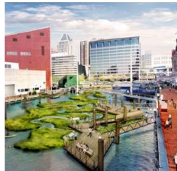
Looking to the future, the National Aquarium's redesigned waterfront campus will be a model for urban conservation and provide local students with opportunities for hands-on scientific exploration.