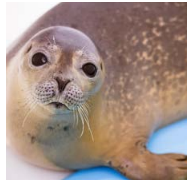
Megatron, released in Ocean City, Maryland, in May 2016, spent 12 weeks in rehab at the National Aquarium, recovering from dehydration, emaciation and skin lesions.